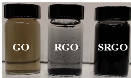
Fig. 1 Optical images of GO, RGO and SRGO dispersed in water at the concentration of 0.5 mg \text{mL}^{-1} .