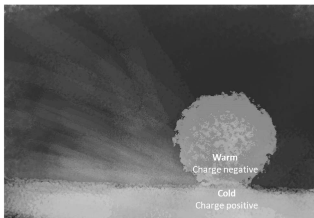
Fig. 2 Schematic representation of the effect of 'asymmetric rubbing' leading to electric charging of snow grains. Intensive friction creates higher temperature gradients and increases charge carrier concentration gradients because protons migrate faster toward cold regions.

ice surfaces homogeneously: the surface of the mobile ice is heated more strongly than the stationary ice surface (Fig. 2). The temperature gradient leads to an ion concentration gradient because protons ( H^+ ) move faster toward cold regions compared to hydroxide ions ( OH^- ). 48 Thus, the colder parts of the snow/ice particle obtain positive charges, while the warmer part becomes negatively charged (Fig. 2). This phenomenon is known as the thermoelectric effect. 50