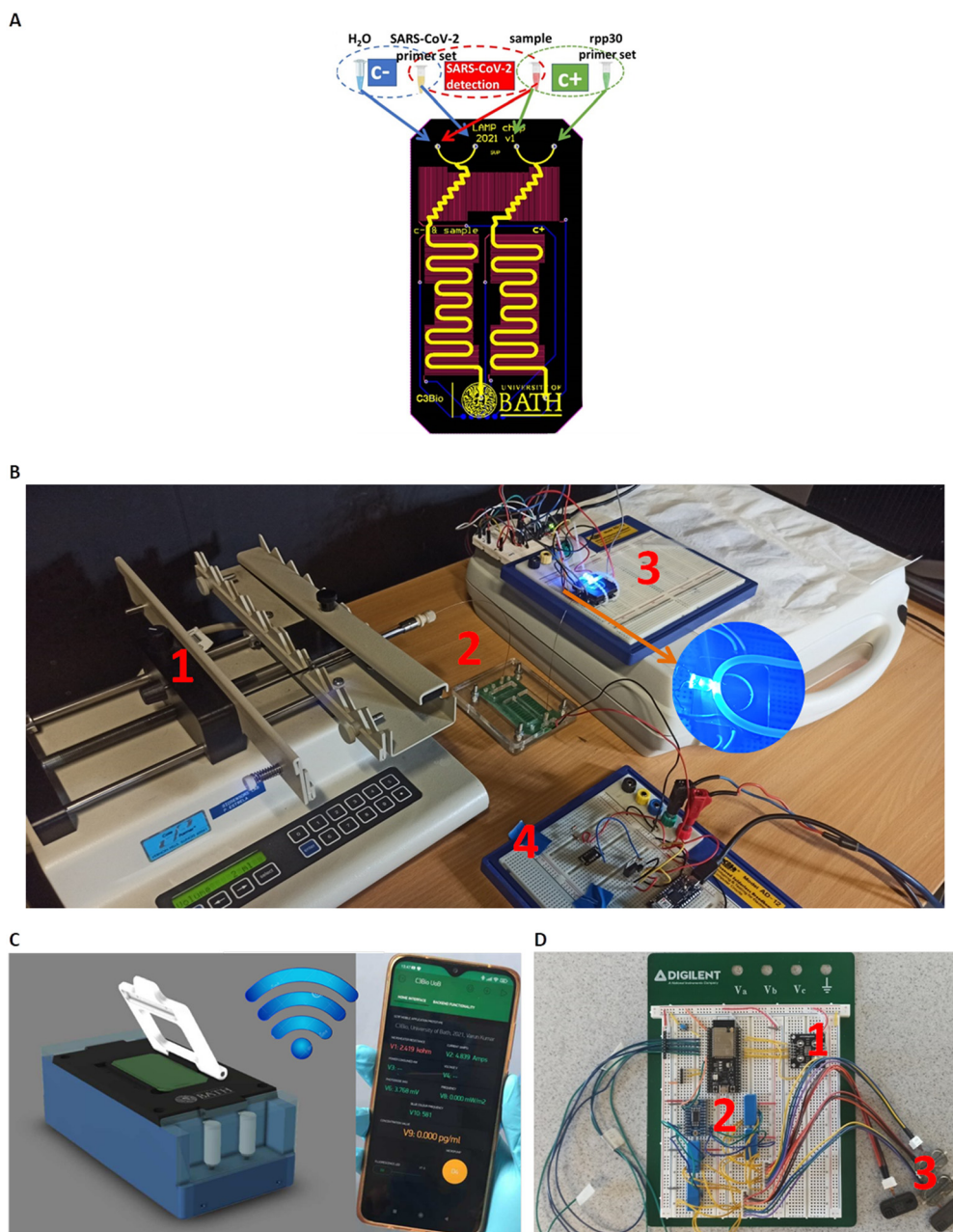
Fig. 1 A) Process schematic of the 3-in-1 SARS-CoV-2 detection platform; input fluidic paths for the negative control (c-) (blue circle), the positive control (c+) (green circle) and the SARS-CoV-2 detection (red circle). The micromixer, the amplification channels and the outlet vias are displayed. Embedded, copper microheaters are displayed in red colour. B) The experimental setup of the ultrafast, real-time quantitative RT-LAMP platform: 1) syringe pump, 2) RT-LAMP on PCB, 3) fluorescence detection and 4) embedded microheaters controller. C) The CAD design of the portable instrumentation which includes all the system parts of the experimental laboratory setup in their compact version. Both the experimental setup and the portable version wirelessly transmit the test results via Wi-Fi to our custom mobile application. D) The prototype breadboard module with the control circuitry of the real-time quantitative RT-LAMP: 1) the optical sensor, 2) the control circuit for the heaters, the micro-pumps and the optical setup and, finally, the 3) Bartels mp6 micro-pumps.

and an essential feature for diagnosis in clinical settings. Therefore, seamlessly integrated SARS-CoV-2 thermal lysis on-chip was also successfully implemented and presented in this paper, using virus-like particles (VLPs) encapsulating specifically designed portions of the SARS-CoV-2 genome as surrogates.