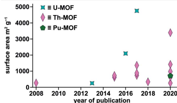
Fig. 5 (Top) X-ray crystal structures of Th_6(\mu_3-O)_4(\mu_3-OH)_4(BPDC)_6 , Th_6(\mu_3-O)_4(\mu_3-OH)_4(BPC)_6 , [Th_3(BPTC)_3O(H_2O)_{3.78}] \cdot Cl , and Th_6O_4(OH)_4(H_2O)_6(TBA)_6 . The pink, blue, gray, and red, spheres represent thorium, nitrogen, carbon, and oxygen atoms, respectively. (Bottom) Literature analysis of the surface areas of several reported An-MOFs over time. 3,59,66,78,134,138,159–163