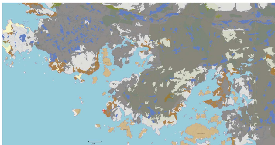
Fig. 1 Sketch map showing the location of the Mace Head, Ireland station (red cross) in relation to the surrounding peat bogs in Connemara extracted from the website: https://gis.epa.ie/EPAMaps/ . The darker brown and grey shades indicate peat which covers approximately 3000 \text{ km}^2 in the Connemara region.

\text{O}_3 measurements were acquired with commercial UV spectrometers, utilising three separate analysers over the period of this investigation. The instruments were Model ML8810 (Monitor Labs San Diego, CA) from April 1987 to March 2003.