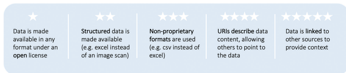
Fig. 5 5-Star plan for open data suggested by Tim Berners-Lee (based on https://5stardata.info/en/ ).

find biosynthetic routes that produce bulk chemicals and industrial chemicals such as ethanol, 52 benzoic acid, 53 toluene, 54 etc., and active pharmaceutical ingredients of pharmaceuticals such as flavonoid 55 and tryptophan. 56 A metabolic map for the production of bio-based chemicals was summarised by Lee et al. 57