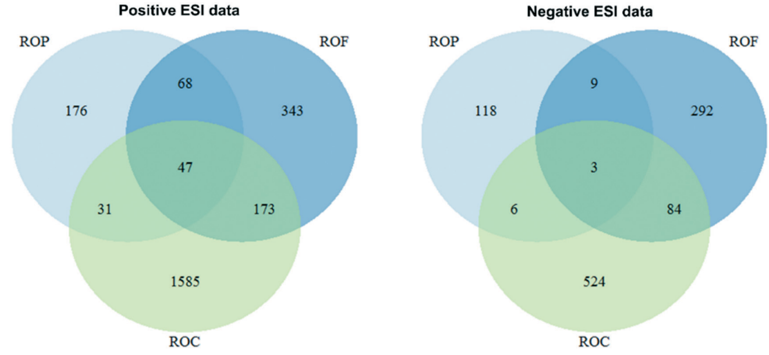
Fig. 2 Venn diagrams of non-target features in samples from the RO drinking water treatment plant detected in positive (left) and negative (right) electrospray ionisation (ESI) datasets. ROF: RO feed water; ROP: RO permeate; ROC: RO concentrate.