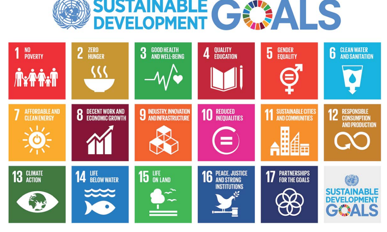
Fig. 1 The 17 SDGs of the UN, aimed at ending poverty, protecting the planet, and ensuring prosperity for all as part of the sustainable development agenda. Each goal has specific targets to be achieved over the period 2015–2030 (http://www.un.org/sustainabledevelopment/sustainable-development-goals/). An 18<sup>th</sup> SDG aimed at clean air should be added.

It is proposed here to adopt an additional SDG on "clean air", at the same level as good health, clean water, sustainable industrialization and cities, responsible production, climate action, marine and terrestrial life (SDGs 3, 6, 9, 11, 12, 13, 14, 15, respectively), not only because ambient air pollution is the leading environmental risk factor of the global burden of disease, but also because many other SDGs cannot be achieved without considering air quality. The next Section 2 focusses on results from the Faraday Discussion meeting Atmospheric chemistry in the Anthropocene , held in York, UK, from 22–24 May 2017, which presented scientific results that underpin this statement. Section 3 presents an update of the