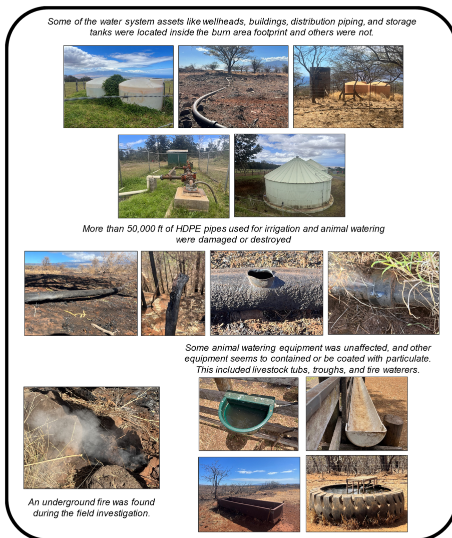
Fig. 3 Some agricultural water system assets were thermally damaged, destroyed, or impacted by particulate.

As of December 2023, Maui DWS had screened water samples from storage tanks, hydrants, and service lines for 24 of the 51 fire-related VOCs (Table 2). The most common chemicals and maximum concentrations detected by Maui DWS in Lāhainā were benzene (40 ppb), methylene chloride (3 ppb), ethyl benzene (2.5 ppb), total xylenes (2.4 ppb), and bis(2-ethylhexyl)phthalate (1.4 ppb), and toluene (1.3 ppb). For several samples, benzene exceeded the 5 ppb federal safe drinking water limit. In Kula, the most common detections and maximum concentrations found were benzene (3.8 ppb), methylene chloride (3.8 ppb), styrene (1.8 ppb), and toluene (1.6 ppb), and no chemicals exceeded federal drinking water