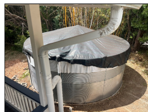
Fig. 2 Two weeks after the wildfire and the evacuation orders had been lifted, some fires were still burning, and various damage and household responses were observed.