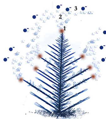
Scheme of ion emission from ice structure