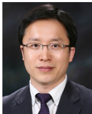
Ho Won Jang

In this review, we focus on 2D materials and their properties to acquire a significantly efficient and stable photoelectrode. Fig. 1 shows the representative 2D materials and their roles in photoelectrochemical water splitting. Firstly, the unique characteristics and superiorities of 2D materials will be introduced. Secondly, we review how 2D materials have been utilized for PEC water splitting and their roles in active catalysts, interfacial transporting layers, passivation layers, and light harvesters. Thirdly, the state-of-the-art 2D materials including transition metal dichalcogenides (TMDs), noble metal dichalcogenides, graphene, graphdiyne, black phosphorus (BP), layered double hydroxide (LDHs), g-C 3 N 4 , and MXenes will be introduced. Finally, several insights regarding the synthetic approach for mass production, stability issues derived from the desorption of 2D materials, and tandem devices for unassisted solar water splitting will be discussed with a perspective on future challenges and suggest solutions to enhance the photoelectrochemical performance.