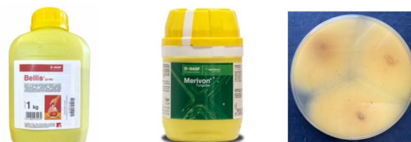
Fig. 4 Inhibition of growth of Aspergillus niger (strain VURV-F 822; measured as a diameter of the inhibition zone, mm) with boscalid, bixafen, fluxapyroxad, and their analogs 28–30 at different concentrations after 48 h of incubation. Fungicides boscalid (@Bellis) and bixafen (@Merivon) are shown. Inhibition of fungal growth by compound 29.

Lipophilicity. To estimate the influence of the replacement of the ortho -benzene ring with bicyclo[2.1.1]hexane on lipophilicity, we used two parameters: calculated lipophilicity (clogP) 27 and experimental lipophilicity (logD).