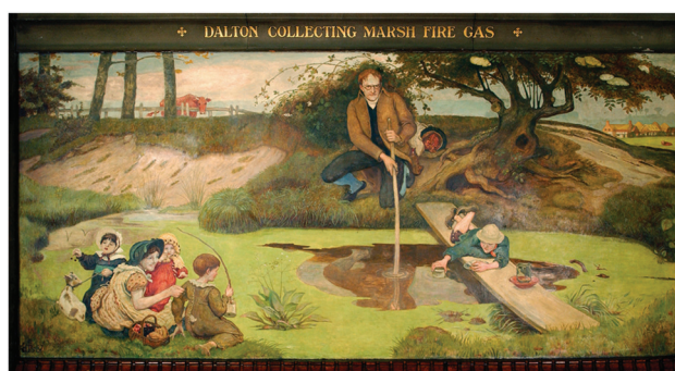
Fig. 2 “Dalton Collecting Marsh Fire Gas” is an 1887 mural by 1887 Ford Madox Brown in the Manchester Town Hall ( https://en.wikipedia.org/wiki/File:BrownManchesterMuralDalton.jpg ).

Atomism was a theme running through science from the late 16 th Century onwards. In his 1612 book, De Principiis atque Originibus , Francis Bacon (1561–1626) presents the case for atomism, although in subsequent work he preferred corpuscularianism. Similarly, Daniel Sennert (1572–1637) in his Hypomnemata Physica develops a model in which matter is composed of indivisible atoms although he also subscribed to the Aristotelian four elements—earth, air, fire, and water. Robert Boyle was a convinced atomist, but he also made important contributions to understanding what should be described as an element. He differed from Sennert in rejecting