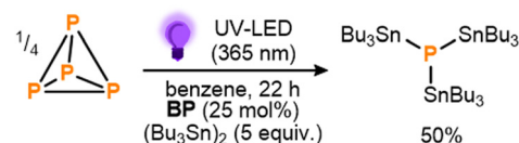
Scheme 3 Initial conditions for the direct, photocatalytic stannylation of P_4 into (Bu_3Sn)_3P optimized using benzophenone ( BP ) as photocatalyst. Stoichiometries in equiv. and mol% are defined per P atom.

These initial results provided a clear proof-of-principle for the proposed mechanistic strategy. Notably, the observed conversion indicates the activation of at least three Sn–Sn bonds per available equivalent of BP , 14 making this a rare example of a system where P_4 activation has been achieved catalytically, using an otherwise inert substrate. 5,9a,9b,9e,15 Nevertheless, in order to improve the reaction outcome further, a broader range of benzophenone derivatives was subsequently screened, with several found to provide markedly improved performance (see ESI,† S5). Particularly impressive results were achieved using