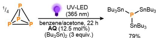
Scheme 4 Optimized conditions for the direct, photocatalytic stannylation of P_4 into (Bu_3Sn)_3P using anthraquinone ( AQ ) as photocatalyst. Stoichiometries in equiv. and mol% are defined per P atom.

anthraquinone ( AQ ) and following brief further optimization (see ESI,† S5 and S7) 79% conversion to (Bu_3Sn)_3P could be achieved using significantly reduced loadings of both AQ (12.5 mol%) and (Bu_3Sn)_2 (3 equiv.) over the same timeframe (Scheme 4; see also ESI,† S7). Based on the catalytic cycle proposed in Scheme 2, this would correspond to a turnover number (TON) of 10.0 for AQ . Further reductions in catalyst loading to 6.3 mol% or 2.5 mol% were found to lead to even higher TONs (16.8 and 28.2, respectively), albeit at the cost of lower overall conversions (see ESI,† S7, Table S11).