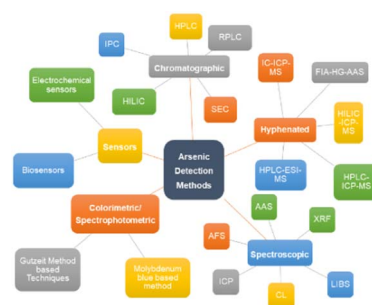
Fig. 3 Different methods of arsenic detection and determination.

The purpose of this review is to provide an overview of the analytical techniques (chromatographic, spectroscopic, colorimetric, biological, electroanalytical and coupled techniques) for arsenic determination in drinking water and the authors have mostly covered the literature over the past decade (2010 onwards). Some older publications are referenced to support the key concepts and wherever necessary. A brief introduction to various analytical techniques followed by an evaluation of their capabilities and performance for arsenic determination are discussed. Associated challenges as well as potential avenues for future research, including the demand for rapid analysis and on-site technologies for remote water analysis and environmental applications are discussed. We hope that this review