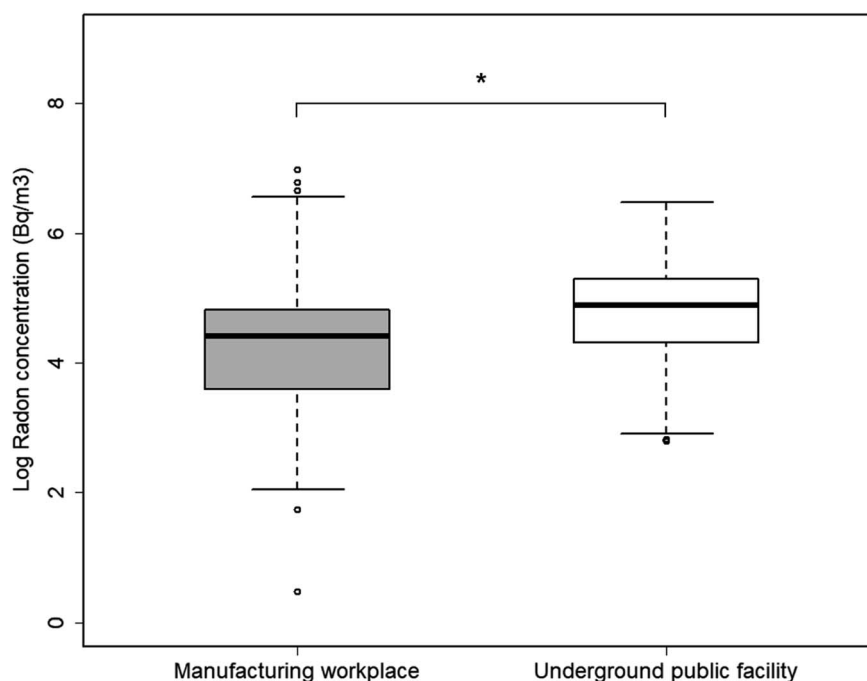
Fig. 2 Box plot of log-transformed radon concentrations measured at the manufacturing workplaces and underground public-use facilities, and the mean radon levels are significantly different ( p < 0.001 ).

The highest level measured for short-term monitoring with the E-PERM® detector for the moulding process of A7 was