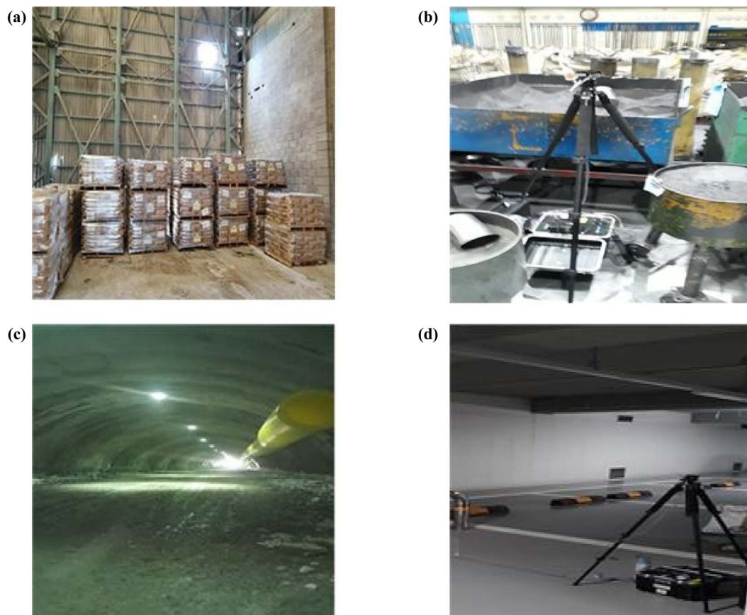
Fig. 1 Photographs of on-site radon monitoring (a) at a warehouse storing radon-containing raw materials; (b) during the moulding process at workplaces; (c) at an underground tunnel; (d) at underground parking lots in underground public-use facilities.

workplaces. The long-term radon measurements were required for a period similar to that of the workplaces, but some measurements were not completed due to repair at two facilities (B9 and B10). All measured radon concentrations were calculated using the international standard unit of becquerel per cubic metre ( \text{Bq m}^{-3} ).