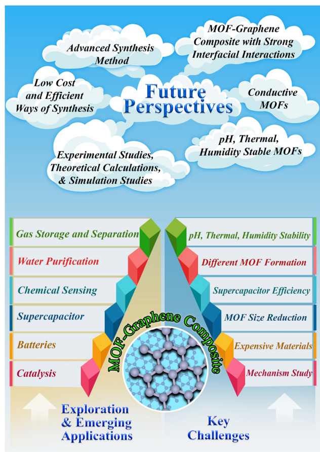
Fig. 19 The exploration, emerging applications, key challenges, and future perspective of MOF-graphene composites.

(f) It is vitally necessary to develop innovative kinds of synthetic techniques in order to streamline the process and