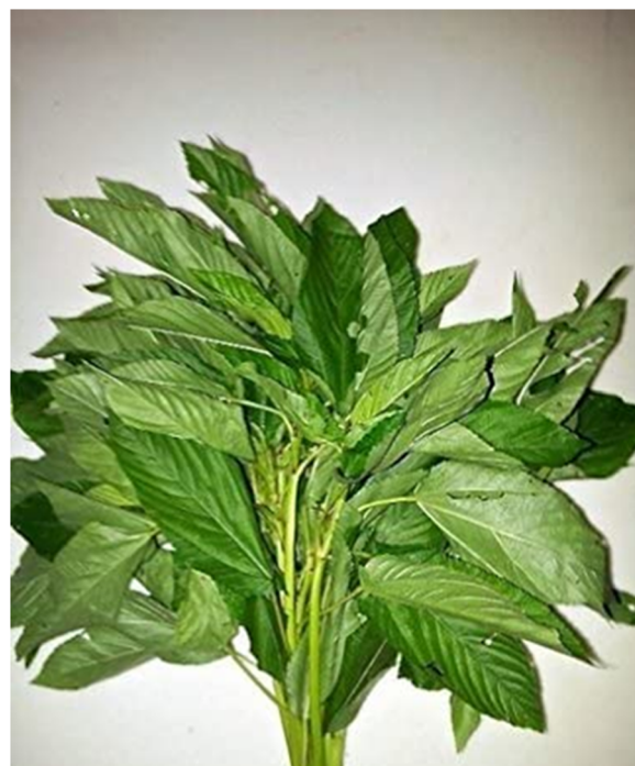
Fig. 1 C. olitorius leaves.

C. olitorius has been shown to have wide spectrum of biological activities, which is certainly related to its phytochemical