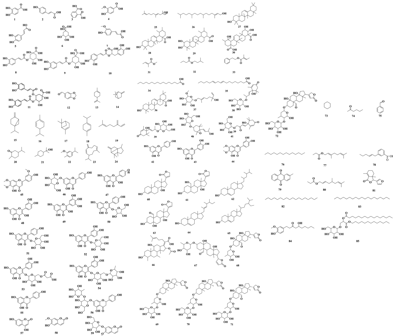
Fig. 2 Chemical structures of the reported compounds from C. olerius .

hydroxytoluene (BHT). The overall quantity of phenolic components in the extracts was linked to their antioxidant properties. Samples with elevated phenolic content demonstrated stronger antioxidant activity. 11