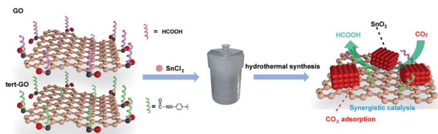
Fig. 1 Synthesis scheme of \text{SnO}_2/\text{GO} and \text{SnO}_2/\text{tert-GO} .

the catalytic conversion of carbon dioxide. Obviously, the chosen supports not only can stabilize the active sites but also provide additional opportunities to enhance the catalytic activity.