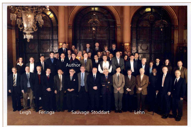
Fig. 4 Participants of the 21 st Solvay Conference on Chemistry "From Noncovalent Assemblies to Molecular Machines", Brussels, Hotel Métropole, 30 November 2007.