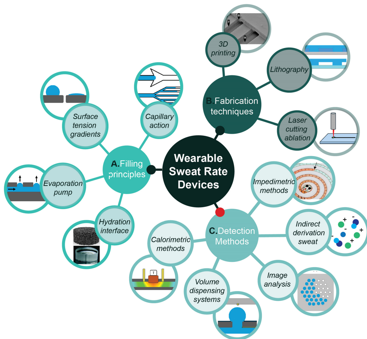
Fig. 1 Schematic overview of the A) filling principles, B) fabrication techniques and C) detection methods involved in the development of wearable microfluidic sweat rate devices. Reproduced with permission. 20–23 Hydration interface upper icon: Copyright 2024, Biomicrofluidics . Hydration interface lower icon: Copyright 2017, Lab Chip . 3D printing icon: Copyright 2017, Anal. Chem. Impedimetric methods: Copyright 2022, ACS Sens .

Recently, wearable sweat sensors integrating a means of measuring flow have been developed. To identify the most promising sweat rate sensor principles, it is valuable to investigate the currently used flow rate sensors and evaluate them on performance and efficiency. This review will focus on sweat rate sensing, by first providing insights into the relevance of measuring sweat rate, followed by common principles to determine microfluidic flow in a sweat patch.