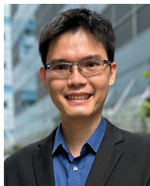
Jason Y. C. Lim

Other polymers that can be used to produce bristles are polyethylene (PE) and polypropylene (PP). These are widely available lightweight polymers that can produce bristles at low cost. The PE bristles tend to be softer and less stiff than those manufactured with nylon, which can be more comfortable for consumers with