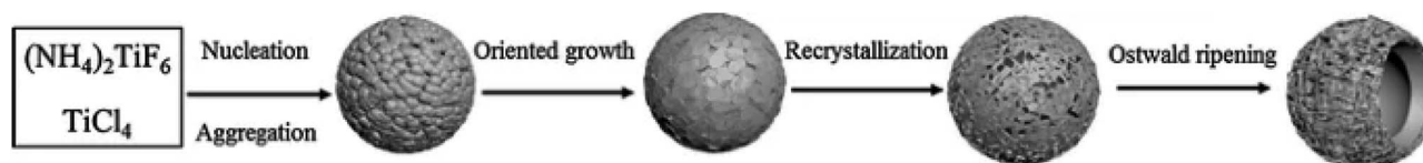
Fig. 6 Schematic illustration of the probable formation mechanism of hollow porous \text{TiO}_2 microspheres. 97

The poor ionic and electronic conductivity of \text{TiO}_2 leads to a capacity far below the theoretical value and poor rate performance, which hinders its practical application in LIBs. Although the preparation of \text{TiO}_2 nanomaterials with a high surface area exhibits good electrochemical performance, it is still difficult to meet the commercial demand. For this reason, it is usually necessary to compound \text{TiO}_2 with other materials, and this review introduces the research progress of different types of \text{TiO}_2 composites, mainly from the compounding of \text{TiO}_2 with carbon, silicon, metals, and metal oxides. 105