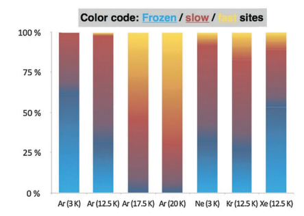
Fig. 3 Mole fractions of frozen, slow, and fast tunnelling sites in different noble gas matrices at several temperatures.

1 and the \tau_{\rm eff} values diminish toward \tau_0 upon elevating the temperature of the Ar matrix (Table 1 and Fig. 3). While a rigorous assessment of various theoretical methods for computing tunnelling rates is beyond the scope of this communication, we report additional predictions of half-lives obtained with the ZCT and SCT approaches implemented in POLYRATE in the ESI.† ^{50-52}