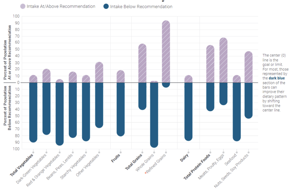
Fig. 4 Comparison of recommendation and dietary intakes of food in U.S. population ages 1 and older. Adapted from Dietary Guidelines for Americans, 1 with permission from the U.S. Department of Agriculture and U.S. Department of Health and Human Services, copyright 2020.

proteins, with exceptions such as soy, quinoa, chia seeds, hemp seeds, and buckwheat, are considered “incomplete proteins” because they are missing, or do not have enough of, one or more of the essential amino acids which makes the protein imbalanced. 9 Moreover, their variable amino acid composition, and their structural complexity, can limit their digestion. For example, the presence of anti-nutrients such as phytic acid, tannins, lectins, oxalates, saponins, protease inhibitors, and glucosinolates further complicates the digestibility and nutrient