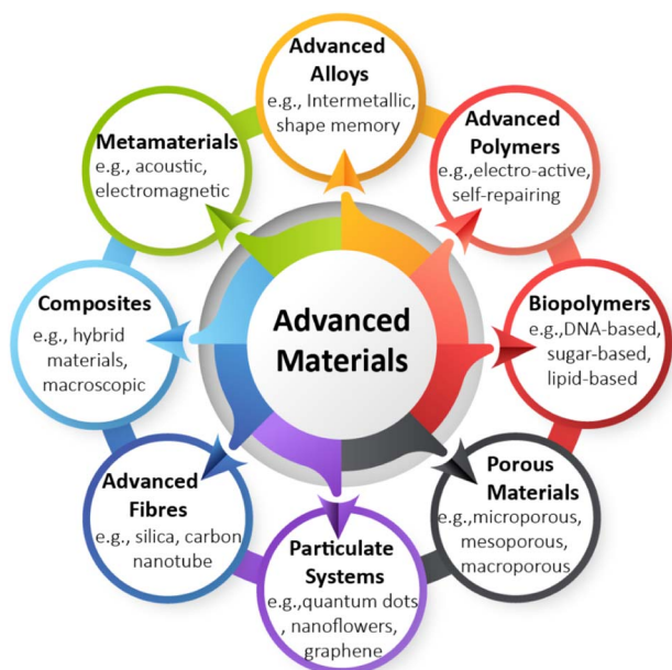
Fig. 1 Clusters of advanced materials proposed by the German Environment Agency (modified after Giese et al. 2020) based upon their physicochemical properties and structure. This classification does not distinguish the active and passive form of the AdMas, or how the physicochemical properties relate to the hazard.

carbon nanotube composites, deformable polymer-based systems and biological molecular motors, have been fabricated so that these can be activated with a specific stimulus, such as pH, light, or temperature. 7,15 Interesting examples are NMs consisting of an elastic polymer network and a molecular