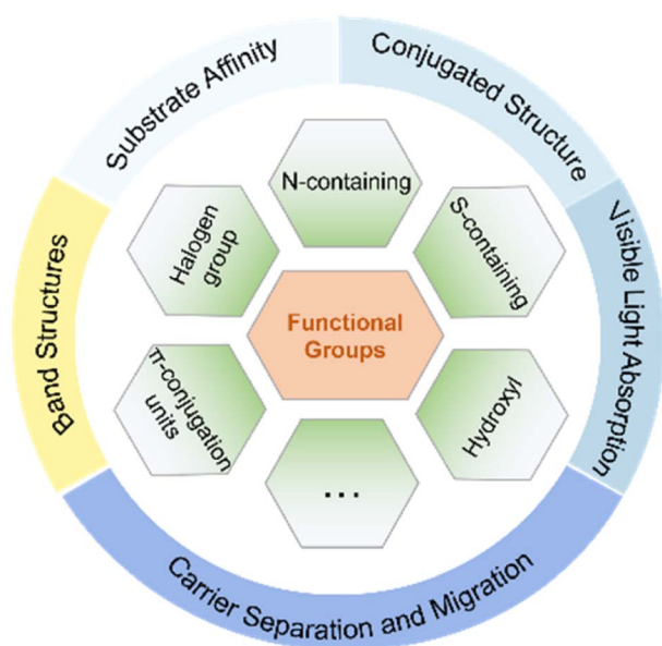
Fig. 7 The roles of specific functional groups in modulating the characteristics of CTFs.

The strategic modification of CTFs with donor-acceptor (D-A) units can enable the fine-tuning of their properties and facilitate anisotropic charge carrier migration, thereby enhancing the photocatalytic activity of CTFs. Recent studies have explored various D-A units, such as thiophene (Th), 36,84,85