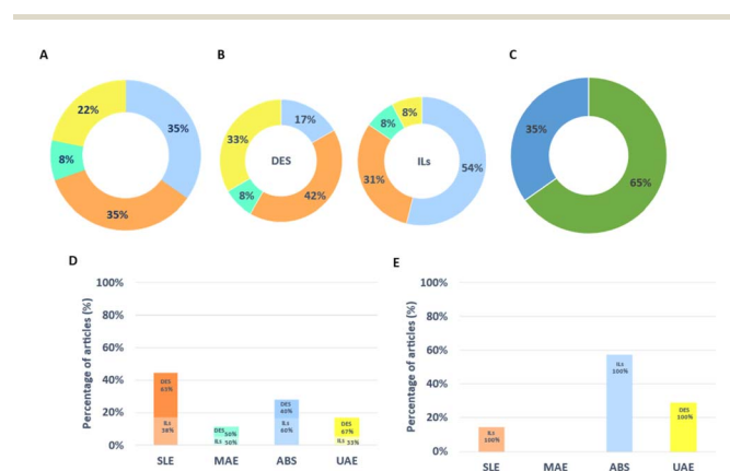
Fig. 2 (A) Distribution of IL/DES-based techniques for the extraction and separation of non-animal proteins and enzymes by (●) conventional SLE, (●) MAE, (●) UAE and (●) ABS. (B) Distribution of DES and IL-based techniques for the extraction and separation of non-animal proteins and enzymes by (●) conventional SLE, (●) MAE, (●) UAE and (●) ABS. (C) Distribution of articles related to extraction and separation of proteins (●) and enzymes (●). (D) Percentage of published articles per extraction and separation technique, using ILs or DES, for proteins. (E) Percentage of published articles per extraction and separation technique, using ILs or DES, for enzymes. Data were obtained from the Web of Knowledge in November 2022.

The described techniques to extract proteins from non-animal biomass, resorting to ILs and DESs as alternative solvents, are discussed in the current review. Fig. 2 shows the status of the literature related to the application of the mentioned IL- and DES-based processes in the extraction and purification of proteins and enzymes from non-animal sources. The techniques most investigated for protein and enzyme extraction and purification are SLE and ABS. These techniques have been mainly applied to proteins, accounting for 65% of the studies, contrasting with 35% of studies dealing with enzymes. In this line, SLE has been mainly applied to proteins, whereas ABSs have been mainly investigated with enzymes.