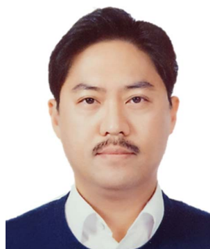
In Woo Cheong

It has been well-known that polymers with self-healing mechanisms are broadly classified into two types: extrinsic and intrinsic. 18 Depending on the specific mechanism, self-healing polymers can be differentiated into several different types. However, most self-healing polymers involve two important steps in the wound-healing process. 19 As illustrated in Fig. 1, when polymers are damaged by external impact (e.g., scratches, cracks, cuts, etc.), the wound should be sutured