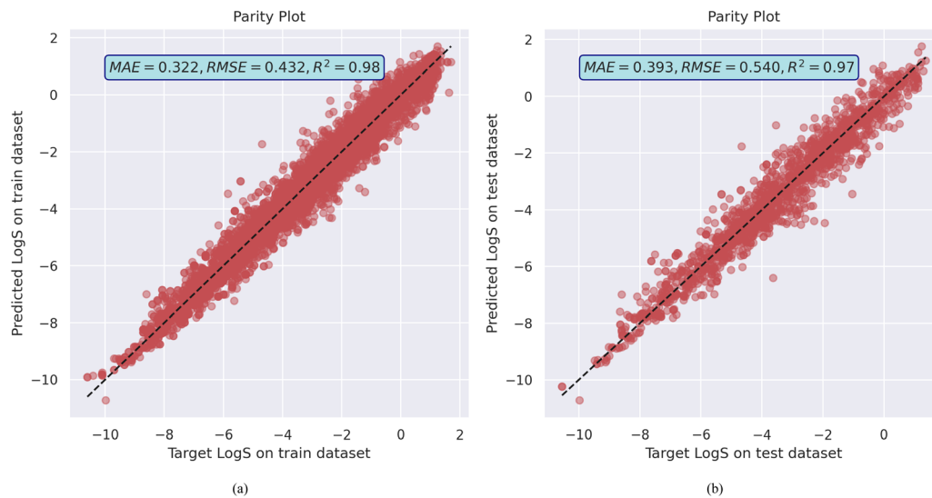
Fig. 1 MolGAT model training and validation performance on AqSolDB (a) the parity plot of predicted against target aqueous solubility values, and (b) the model train and test losses.

on the training dataset. It also generalized reasonably well on the validation dataset, with an MAE of 0.393 and RMSE of 0.540 with R^2 of 0.97, as shown in Fig. 1a and b as well as training and validation error plot in Fig. S6 (ESI † ). This level of performance suggests that the MolGAT model effectively learns to map molecular graphs to the solubility values. The graph-based architecture allows it to leverage both the structural information (atoms and bonds) and properties of individual atoms. The attention mechanism helps the model to focus on the most