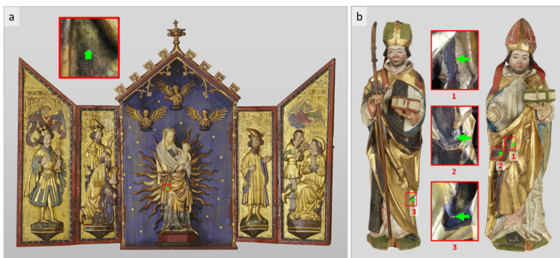
Fig. 1 (a) The central altar figure Mary (Inv. No. LM16701.2) in the Leiggern Altar (Inv. No. LM16701.1), 1420, Swiss National Museum (SNM); (b) sculptures St. Bishop (Inv. No. 1941.282) (left) and St. Nicolaus (Inv. No. 1941.281) (right), 15c, Historical Museum Basel (HMB), Switzerland. The sample-taking positions are indicated by green arrows.

Ptychographic X-ray computed tomography (PXCT) is a 3D imaging technique that, instead of using image-forming optics, uses iterative mathematical routines to analyse the X-ray scattering patterns of a sample as a function of rotation and translation to reconstruct a full 3D image of the refractive index variations within the sample. 28–31 The resolution of ptychography is not given by the scanning step nor by the beam size, as with scanning probe microscopy, but rather by the widest-angle scattering observed that correspond to the shortest-length features, or sample variations. 32,33 PXCT is thus among the X-ray techniques with the highest resolving power. 34–37 PXCT provides a quantitative measure of the complex-valued refractive index (both absorption \beta and refraction \delta ) distribution in a specimen. Measurements performed with hard X-rays tend to show higher contrast in \delta due to the high penetration power (low absorption) of hard X-rays. While measurements using an X-ray energy close to an elemental resonance can be used to increase sensitivity to particular materials, utilising an X-ray energy far from such resonances will provide \beta and \delta values that both correlate roughly proportional to the mass density of the sample materials. Hence, given some foreknowledge of the sample composition, the identity of a material