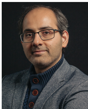
Amir A. Zadpoor

Beam-based unit cells are usually polyhedra whose edges are made from structural elements with relatively large ( i.e. , \gg 1 ) length to diameter ratios that could carry both bending and axial loads. When only one type of unit cell is used in the design of the porous structure, the unit cell should be able to fully fill the space when repeated in different directions. Such polyhedra are called “space-filling” or “plesiohedron” 70,71 and are capable of tessellating the three-dimensional space. From the five