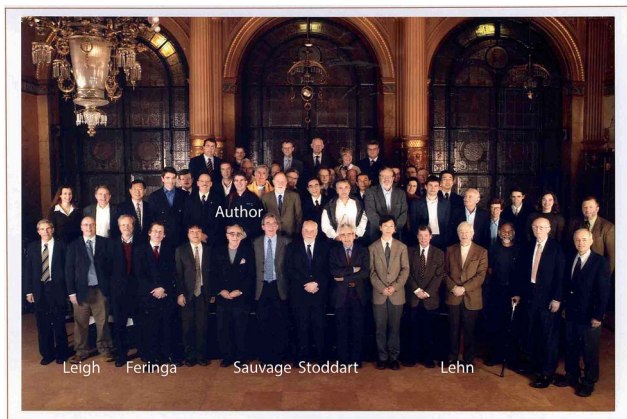
Fig. 4 Participants of the 21 st Solvay Conference on Chemistry "From Noncovalent Assemblies to Molecular Machines", Brussels, Hotel Métropole, 30 November 2007.