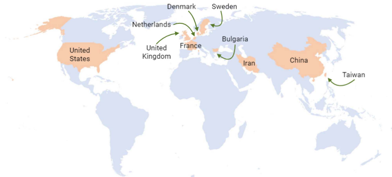
Fig. 5 Top ten countries with nanotechnology standards to date. 17,18 Original creation (using Excel and Biorender programs) based on information obtained from http://www.statnano.com (accessed on December 6th and 14th, 2023). 17,18

that some NMs have the same chemical formula as the other bulk materials; thus, NMs must be considered “new substances.” In this situation, the Royal Society and The Royal Academy of Engineering in the United Kingdom favoured treating chemicals in nanoforms as new substances under the Registration, Evaluation, Authorisation, and Restriction Chemicals (REACH) criteria. Similarly, The Danish Board of Technology (2006) proposed classifying NMs separately from existing chemicals. 135