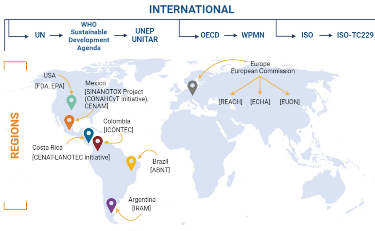
Fig. 4 National and international authorities, agencies and initiatives developing frameworks, legislations, and guidelines for nanomaterials. UN, United Nations; WHO, World Health Organisation; UNEP, United Nations Environment Program; UNITAR, United Nations Institute for Training and Research; OECD, Organisation for Economic Cooperation and Development; WPMN, Working Party on Manufactured Nanomaterials; ISO, International Organisation for Standardisation; ISO-TC229, International Organisation for Standardisation Technical Committee 229; USA, United States of America; FDA, Food and Drug Administration; EPA, Environmental Protection Agency; SINANOTOX, National Nanotoxicological Evaluation System Initiative; CONAHCyT, National Council of Humanities, Sciences and Technologies; CENAM, National Centre of Metrology; CENAT, National Centre of High Technology; LANOTEC, National Laboratory of Nanotechnology; ICONTEC, Colombian Institute of Technical Norms; ABNT, Brazilian Association of Technical Norms; IRAM, Argentinian Institute of Normalisation and Certification; REACH, Registration, Evaluation, Authorisation, and Restriction Chemicals; ECHA, European Chemical Agency; EUON, European Union Observatory for Nanomaterials. Original creation (using Excel and Biorender programs) based on information obtained from ref. 12, 31, 79–81, 94, 98, 115, 124–137, 143, 144, 159, 180, 189, 202–204, 269.

The momentum of nanotechnology development, establishment, and consolidation paths varies and differs between