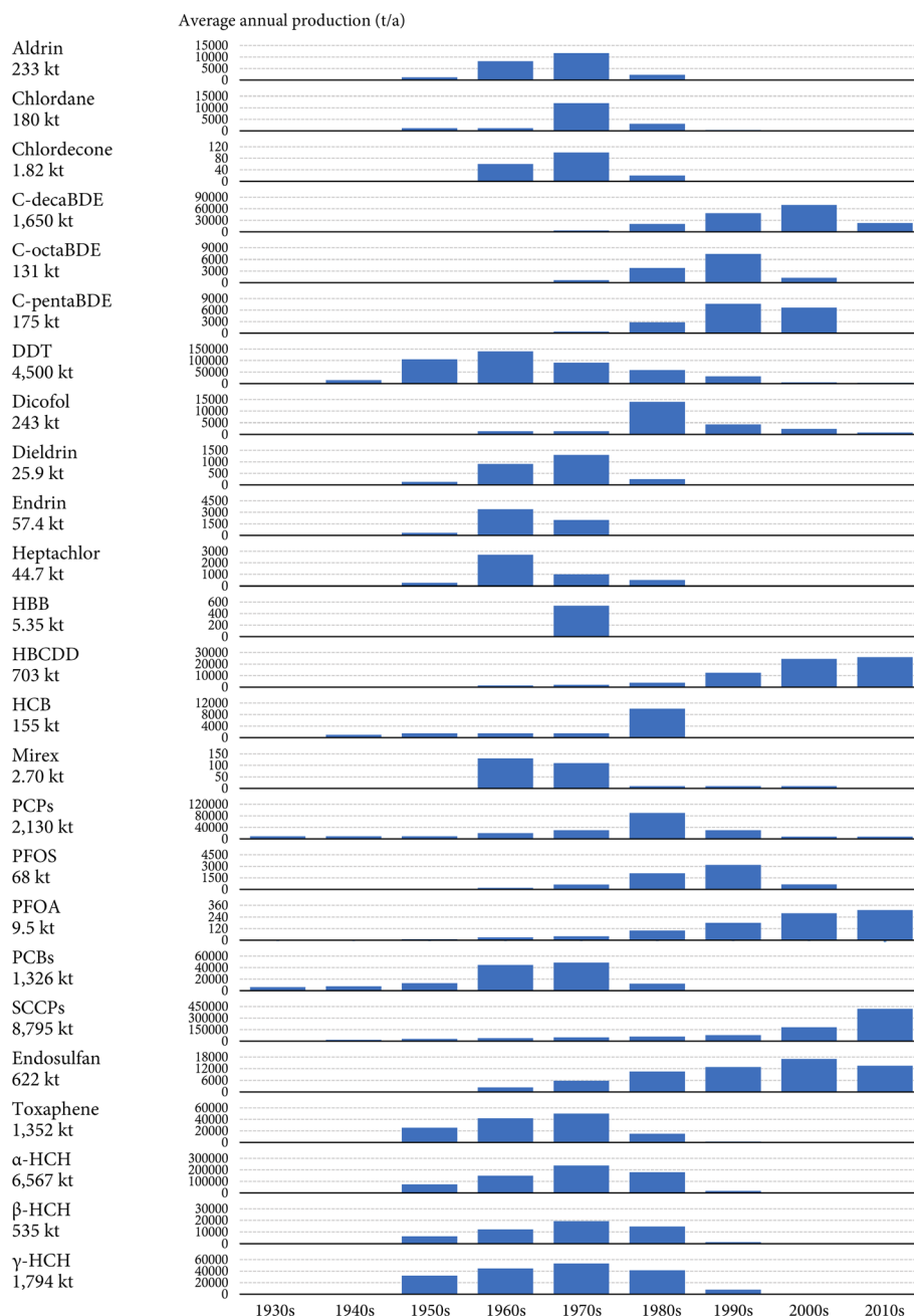
Fig. 1 Average annual global productions of the 25 intentionally produced persistent organic pollutants from the 1930s to the 2010s. Numbers under the chemical names on the left indicate the central-tendency estimate of the global cumulative production in kilotonnes (kt).

of 31 306 kilotonnes (kt) of the 25 investigated POPs have been synthesized and commercialized worldwide in history. For comparison, this number is five times the weight of the Great Pyramid of Giza (5750 kt), \sim 600 times the weight of the Titanic (50 kt), and \sim 3000 times the weight of the Eiffel Tower (10 kt). Notably, the global cumulative production was greater than 1000 kt for eight POPs and greater than 100 kt for 9 other POPs.