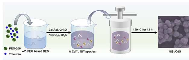
Fig. 1 A schematic illustration of the formation of \text{NiS}_2/\text{CdS} photocatalyst.

For the characterization of the obtained samples, the following techniques were used. X-ray powder diffraction (XRD) performed on a D/max-2550/PC diffractometer (Rigaku), a scanning electron microscope (SEM), energy dispersive X-ray spectroscopy (EDS), and elemental mapping images on a Hitachi