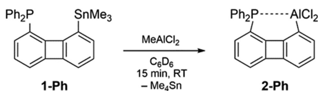
Scheme 2 Al-Sn exchange starting from 1-Ph and MeAlCl 2 to give 2-Ph .

To investigate in how far this prominent P → Al interaction in 2-Ph diminishes the Lewis acidity of the alane function, which an external substrate experiences, the Fluoride Ion Affinity (FIA) was calculated and the Gutmann-Beckett acceptor number (AN) was ascertained experimentally (see ESI†). Notably, in spite of the repulsion between the phosphine and the negatively charged fluoroaluminiate unit in the calculated