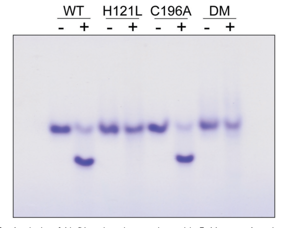
Fig. 3 Analysis of NafY variant interaction with FeMo-co. Anoxic native gel stained with Coomassie, showing the shift in NafY mobility upon FeMo-co binding. Symbols above lanes indicate NafY samples without (-) or with (+) FeMo-co. DM, H121L/C196A double mutant.

To understand why H<sup>121</sup> but not C<sup>196</sup> was important for NafY/FeMo-co complex stability, the initial exploratory MD calculations ("trajectory 1") were supplemented with two additional simulations restraining in input only the presence of H<sup>121</sup> ("trajectory 2") or only the presence of C<sup>196</sup> ("trajectory 3"). The results revealed that the presence of H<sup>121</sup> suffices to keep FeMo-co bound in the site whereas releasing this restraint in exchange for restraining only the presence of C<sup>196</sup> gave place to unstable FeMo-co geometry, which moved nearly freely while "anchored" at C<sup>196</sup>. In fact, trajectory 1 and trajectory 2 results were nearly indistinguishable regarding the H<sup>121</sup>·Nδ1-C<sup>196</sup>·Sγ distance while trajectory 3 showed very large variations. Since RMSF values of the protein backbone were similar in the three