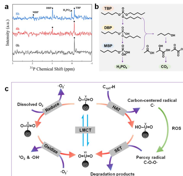
Fig. 5 (a) ^{31}\text{P} NMR spectra acquired at different stages of degradation, (b) schematic diagram of photocatalytic degradation of TBP, and (c) proposed mechanism for the photocatalytic degradation of organic substances by U@GO-1000.