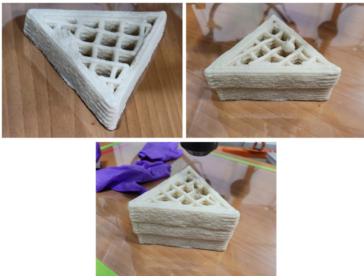
Fig. 3 Large scale triangular samples prepared using the wood pulp and nanoclay filled ink, featuring 5 × 3 inch sides.