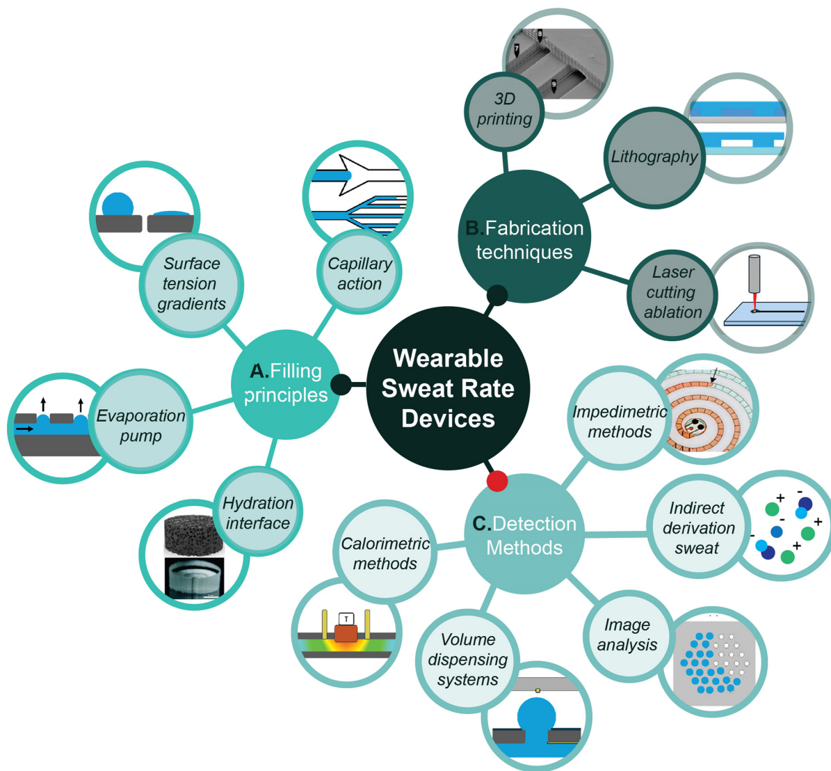
Fig. 1 Schematic overview of the A) filling principles, B) fabrication techniques and C) detection methods involved in the development of wearable microfluidic sweat rate devices. Reproduced with permission. 20–23 Hydration interface upper icon: Copyright 2024, Biomicrofluidics . Hydration interface lower icon: Copyright 2017, Lab Chip . 3D printing icon: Copyright 2017, Anal. Chem. Impedimetric methods: Copyright 2022, ACS Sens .

Recently, wearable sweat sensors integrating a means of measuring flow have been developed. To identify the most promising sweat rate sensor principles, it is valuable to investigate the currently used flow rate sensors and evaluate them on performance and efficiency. This review will focus on sweat rate sensing, by first providing insights into the relevance of measuring sweat rate, followed by common principles to determine microfluidic flow in a sweat patch.