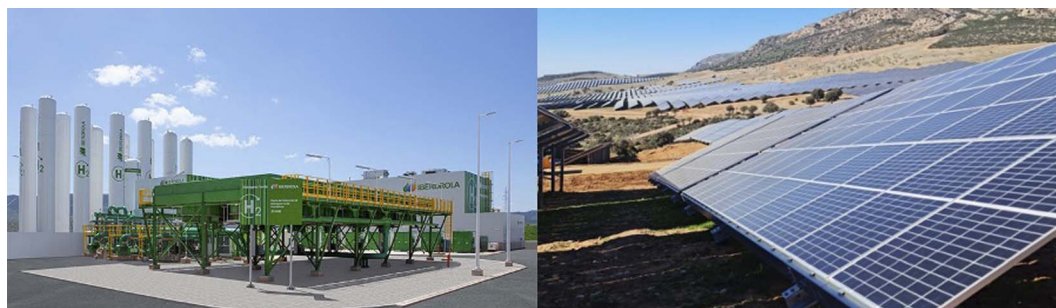
Fig. 16 Green H_2 production facility, Iberdrola, established in the year 2022 in Spain. This water electrolysis facility produces 360 kg of H_2 per hour and is powered by a solar photovoltaic plant with an installed capacity of 100 MW p. The plant also has a Li-ion battery system for streamlined and steady electrical power supply to the plant. This clearly illustrates that green H_2 production requires not only a renewable electricity generation system but also an electrical energy storage system.

The case of producing green H_2 is being pursued actively across the world as it is being forecast to play a significant role in decarbonizing energy generation as well as supplement grey H_2 usage in several hard-to-abate applications. 62 The two main