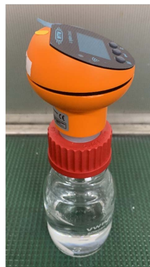
Fig. 3 Commercial biodegradability measuring machine.

Sapuan et al. prepared starch-derived bioplastic via the casting method. They used corn starch, water and plasticizer to prepare a starch-based film at 85 °C (Fig. 6). They demonstrated that