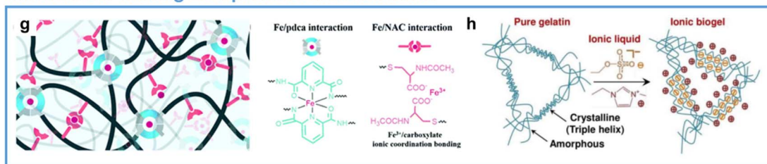
Fig. 2 Healing mechanisms. Extrinsic SH: (a) single and (b) all-in-one capsule-based self-healing composites. (c) The side and (d) cross-sectional view of the epoxy-based nano-vascular network. Intrinsic SH 1 – Covalent Adaptable Networks (CANs): (e) disulfide based dynamic acrylate networks. (f) Reversible imine bond formation during self-healing process. Intrinsic SH 2 – supramolecular networks: (g) the metal ion coordination complexes formed by weak and strong interaction of PDMS network with Fe metal. (h) Ionic cross-linking to the gelatin polymer chain forming a supra-molecular hydrogen bonding network.