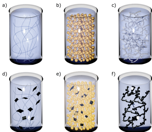
Fig. 4 Schematics showing typical yield-stress fluids used as inks in direct ink writing: (a) polymeric gels, (b) emulsions and (c) colloidal dispersions. Materials for energy storage can be added to these formulations to obtain functional inks (d–f).

where \tau is the shear stress, K the viscosity parameters, n the flow index and \tau_y the yield stress. This empirical model assumes that the ink cannot flow for values of stress lower than \tau_y , and that it presents a rate-dependent viscosity during flow (either shear-thinning if n < 1 , or shear-thickening if n > 1 ).