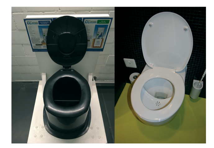
Fig. 1 The Envirosan urine-diverting dehydration toilet (UDDT: left) and the Roediger urine-diverting flush toilet (right).

some popularity as an alternative to conventional dry toilets, especially because they give rise to less odor.<sup>52</sup> In Durban, South Africa, a new law obliged the municipality to provide sanitation to all from 2001, resulting in the installation of double vault UDDTs to serve the areas without sewers.<sup>53</sup> With urine infiltrating the ground and alternate use of the fecescontaining vaults, it was possible to evacuate the vaults in a relatively safe way to gain organic matter for soil improvement. However, whereas Europeans are largely in favor of urine-separating flush toilets, albeit quite critical with respect to the toilet technology available,<sup>51</sup> the UDDTs are not at all popular in Durban.<sup>54</sup> With the flush toilet being the standard solution in the affluent parts of Durban, the affected population considers dry sanitation an unattractive and unjust solution for the poor.55