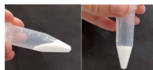
Fig. 1 DES in water emulsion (30 : 70 volume ratio) stabilised by 1.5 wt% OCNF after more than 200 days at room temperature.

The hydrophobic chains on C8-OCNF will allow greater interaction with the hydrophobic DES, compared to unmodified