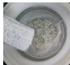
Fig. 8 Colour difference between pristine, unused beads, and those which had been used in testing multiple times.

During the study it was clear that the catalyst material was becoming darker in colour (Fig. 8), turning from the original pristine white to a light brown colour, most likely from the build-up of transition metal deposits or carbonaceous material from the water sources. Throughout this study, the same regeneration technique was used as in previous laboratory studies, whereby the beads were rinsed in distilled water and calcinated in a furnace at 500 °C for 1 hour after each use. In doing so, any remaining contaminants could be removed from the photocatalyst's active sites, meaning the beads remained active for the duration of the study and