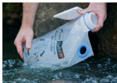
Fig. 1 The SolarBag by Puralytics in use.

Commercial options are also very limited, though one noteworthy example is the SolarBag by Puralytics (Fig. 1). 20 This is a promising example of solar photocatalysis being utilised to remove pollutants from water as a personal, point-of-source method and has won numerous awards for innovation in the field of water treatment. Puralytics claim that “The water is purified in 2–3 hours on a sunny day or 4–6 hours on a cloudy day or if the source water is tea-colored. An indicator tells you when the water is ready”. 20 However, the price-per-unit is very high ($80 for one bag, which is quoted to last up to 500 times), limiting its applicability in less affluent, rural areas, with much of its use being part of disaster relief or charitable provision.