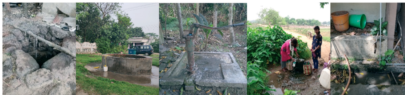
Fig. 2 Images of the water sources used throughout this investigation. From left to right: W1P, W2B, TW, STW, CW.

Water from sources W1P, W2B, TW and STW does not receive any treatment before being used for drinking, and as such the consumption of this water is a cause for concern