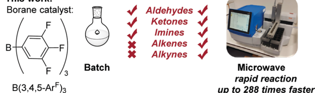
Fig. 1 Previous work on borane catalysed hydroboration with conventional conditions (top) and this work, assisted with enabling technologies (bottom).