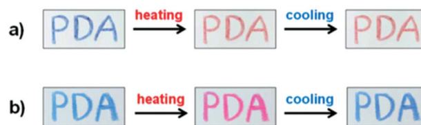
Fig. 22 Handwritten PDA image on paper derived from (a) PDA-wax when heated at 70 °C for 30 seconds then cooled and (b) colorimetric response of PDA-mBzA-wax heated to 120 °C and cooled.

investigations, license validations and biometric security. The group was able to fabricate a PDA system that is stable under high relative humidity (>90%) and is printable on conventional paper. The printing ink was made with deionized water solution of imidazolium containing PCDA monomer, then diluted with 20% volume of ethanol. Upon UV irradiation, blue colored images were formed and red color was developed when in contact with water (Fig. 23a). It was also demonstrated that the intensity of the blue to red color transition was dependent on the water quantity used to overcoat the PDA printed regions on the paper (Fig. 23b). Furthermore, the chromatic transition sensitivity appeared to not be affected when conventional printer ink was overlayed on the PDA-printed region (Fig. 23b, middle). It was also shown that the colorimetric transition upon water contact was temperature dependent and only occurred above 20 °C (Fig. 23c). The image was stable for >1 month when stored at ambient condition and over 6 months in the refrigerator.