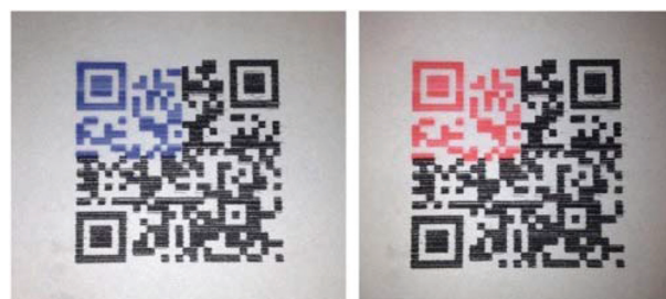
Fig. 17 QR code with partial area of TCDA/ZnO fabricated by inkjet printing methods to serve as a time temperature indicator.